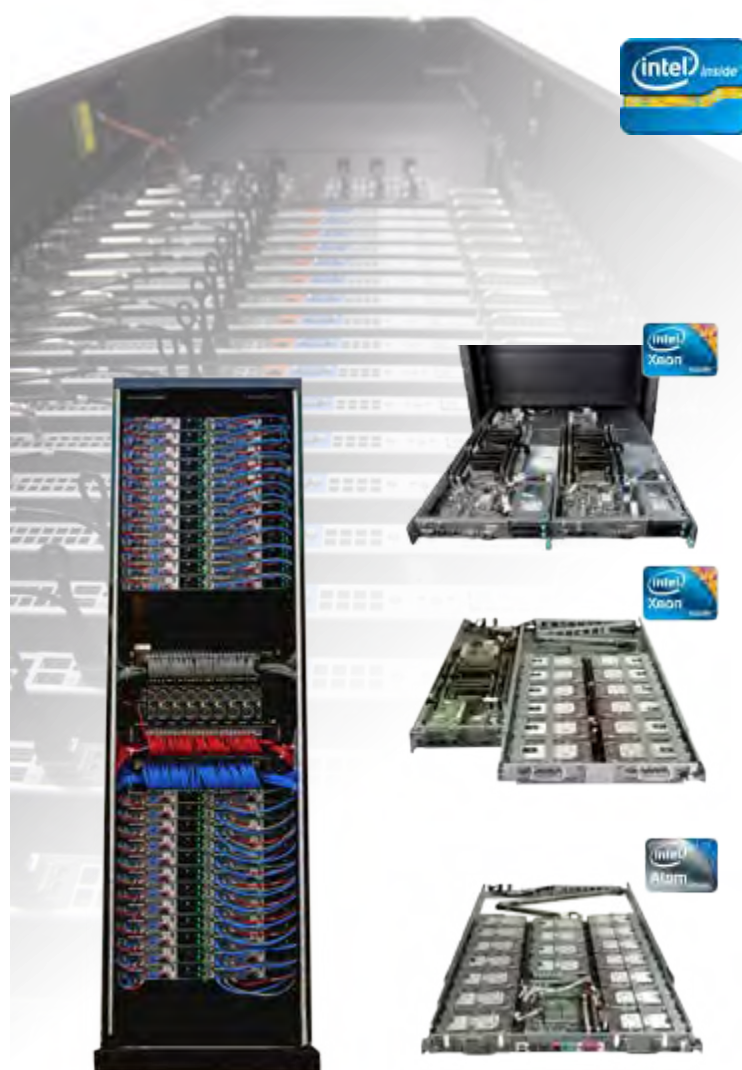
A80G3 Rack Solution